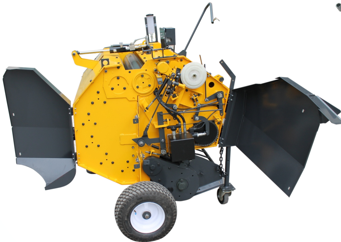
HIGH DENSITY PARTS